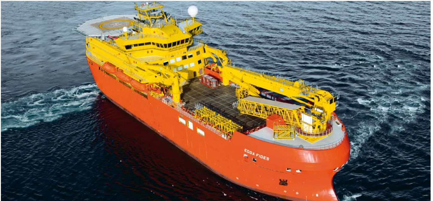
Accommodation and service vessel "Edda Fides"

OFFSHORE - Taking advantage of the booming offshore market, the SAM Group has won a considerable number of orders in a wide range of areas. Key factors in this success include the company's broad technology base and its international setup including subsidiaries and partner companies in Europe, Asia and America.