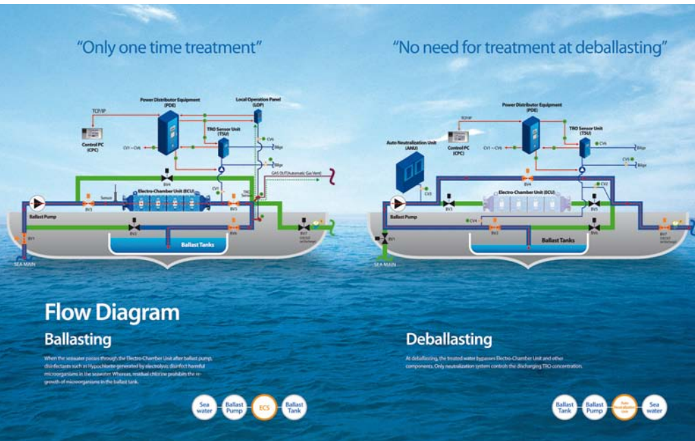
Process schematic