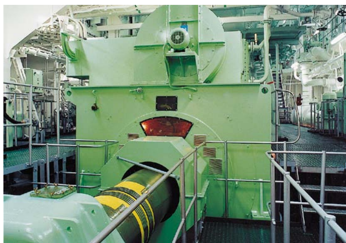
Shaft alternator mounted in the propeller shaft line

ENERGY SAVINGS - Based on over 40 years of experience and the installation of over 400 systems with power outputs ranging from 200 to 4,500 kW, SAM is expanding its market leadership in shaft alternators.