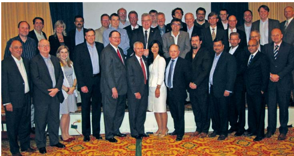
Business development team of M&PS

Participants from more than 11 countries met with a special focus on highly dynamic markets, such as Brazil, India, South East Asia, China and South Korea.