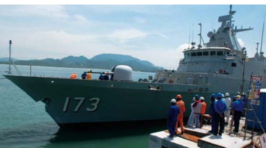
Taking the OPV on a test drive

customer and the partners that made this know-how transfer possible and ensured the overall success of this project - from installation right through to startup. The long project runtime resulted largely from an interruption of around 18 months starting around the end of 2005, when PSC-NDSB was taken over by the Boustead Naval Shipyard. This company resumed construction of ships 3-6 as of mid-2007.