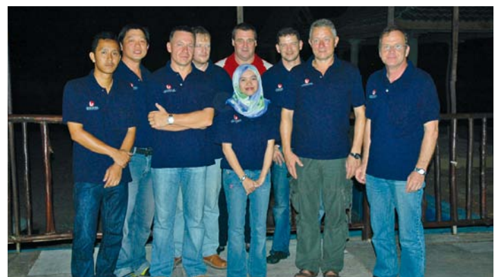
SAM's on-site project team

It was the technical expertise and social skills demonstrated by the SAM team and the excellent cooperation shown at all levels between the