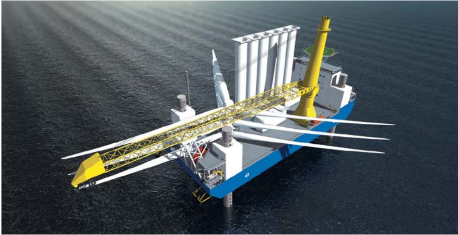
Offshore wind farm construction vessel

comprehensive drive systems. This includes the construction vessel for RWE Innogy, which is scheduled to be taken into operation at Daewoo Shipbuilding & Marine Engineering (DSME) at the end of 2011. SAM's subsidiary L-3 Marine Systems Korea is equipping this special vessel - measuring 109 meters long and 40 meters wide - with the integrated NACOS Platinum navigation system and the dynamic positioning system from L-3 DP&CS in the USA.