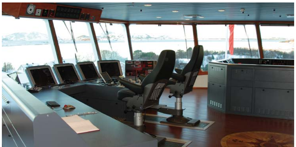
Bridge of the "Skandi Aker"

The 130m-long accommodation service vessel "Edda Fides", recently delivered to the Norwegian Østensjø Rederi by the Spanish shipyard Astellieros HJ Barreras, Vigo, was also equipped with an integrated navigation system comprising an S-band and an X-band radar, three multipilot workstations connected to the bridge wing, and two Chartpilot stations. Each of these multipilot workstations can be used as standard as a radar or ECDIS including conning functions. Additional navigation systems were supplied alongside the Trackpilot for accurate tracking and VDR 4350. The ship is designed to transport around 600 people to and from platforms located in the North Sea.